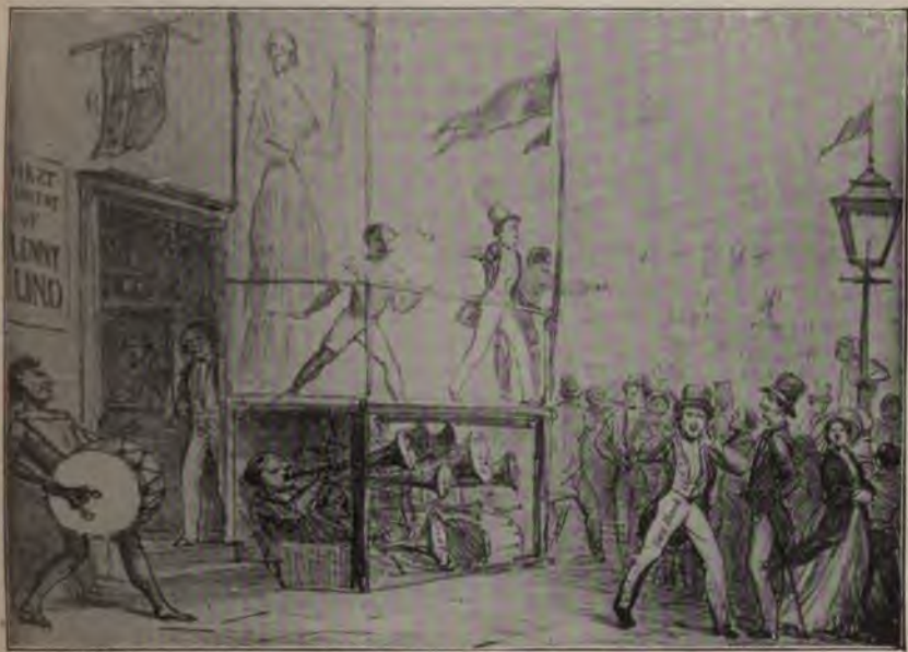
RIDICULE OF JENNY LIND'S POPULARITY IN 1850.